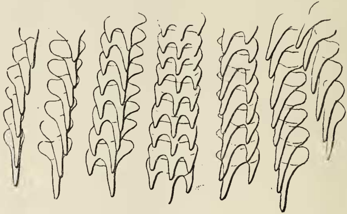
Fig. 4.— Symplectoteuthis luminosa sp. nov. camera drawing of radula, \times 60 .

The radula comprises seven series of teeth; the median tooth being tricuspid, the lateral bicuspid and both marginals unicuspid; the outer marginal teeth are very narrow, the length